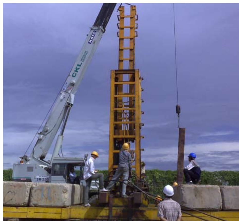
02 | PilingforfoundationatGS2-PhnomPenh