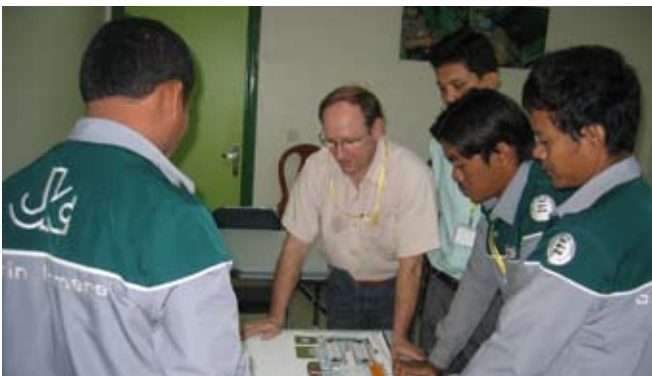
02 | AC&RefrigerationtraininginPhnomPenh