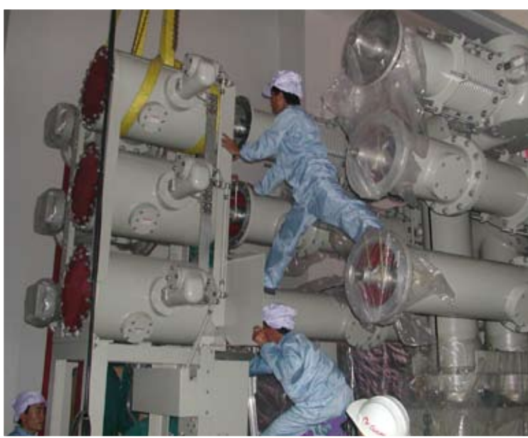
01 | TaoDan-AssemblingGiSbusducts